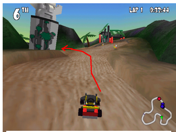
World Two Shortcuts And Secrets

Hit the object in the box with any red power-up to make it disappear, revealing a shortcut connected to the other shortcut on this level.