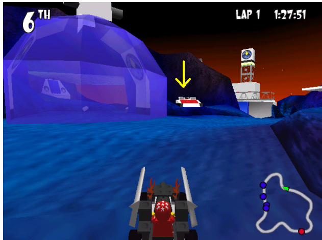
Blue Globe Shortcut